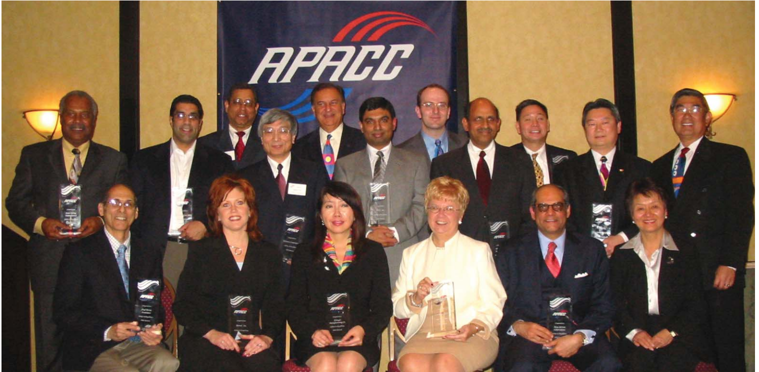
2006 Salute to Excellence Honorees