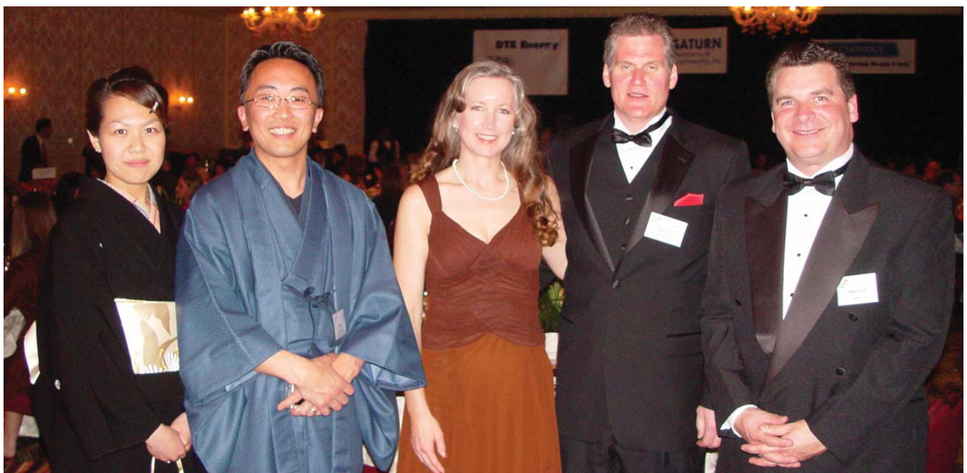
FedEx & Saturn Electronics & Engineering guests