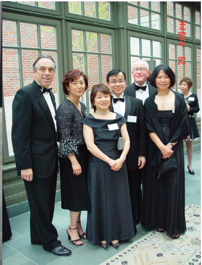
DTE Energy and Toyota Tech Center Guests at VIP reception