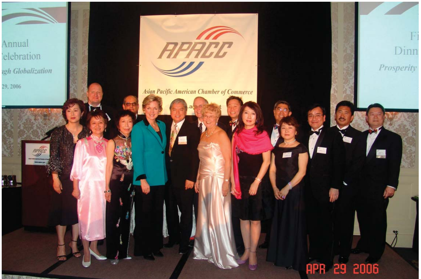
Governor Granholm Corporate Sponsors & APACC Board of Directors